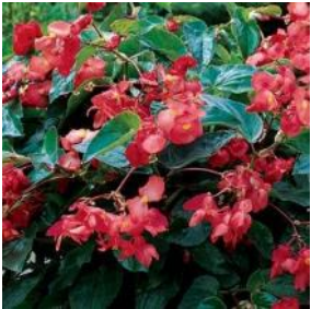
Dragon Wing Red